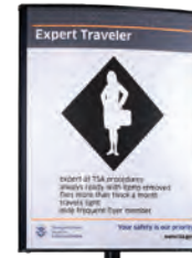
Black: Black Frame Black Post