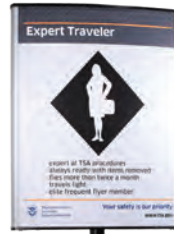
Basic: Silver Frame Black Post