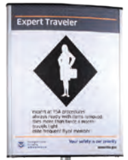
Silver: Silver Frame Silver Post