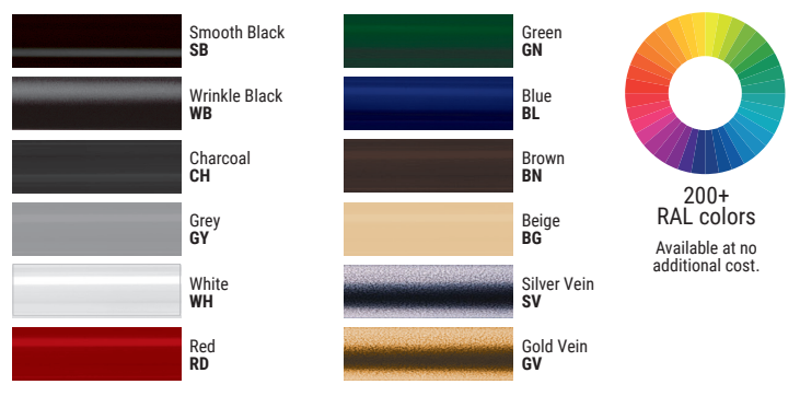
Class 1: Powder Coat over Steel Posts1

Class 1 specialty finishes require a minimum order of 5 pieces and a 2-3 week lead time. Call if quicker delivery is needed.