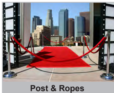
Post & Ropes