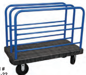
Model # PNPSC-22