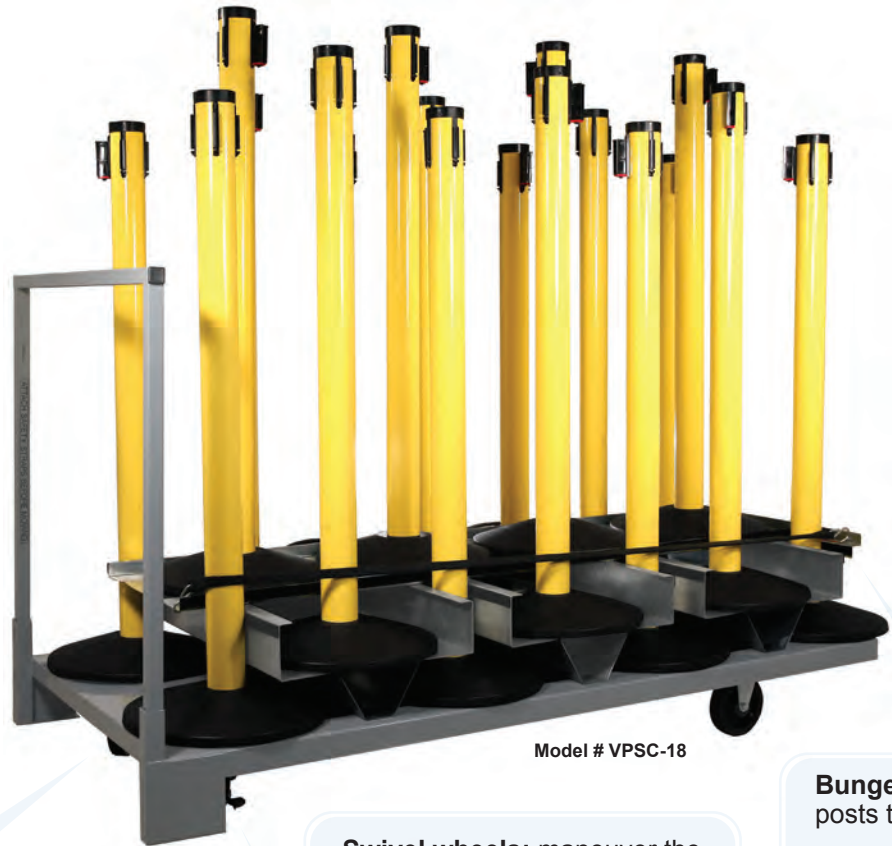
Model # VPSC-18

Swivel wheels: maneuver the cart easily and lock into place.