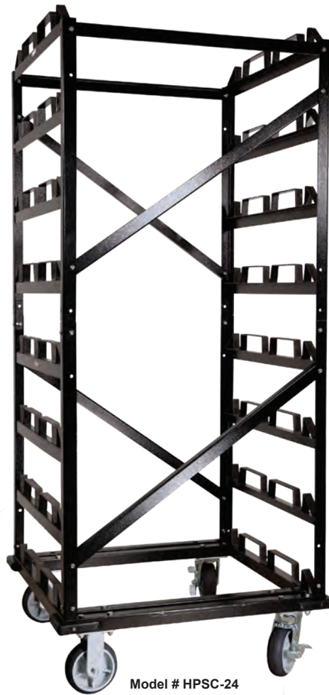
Model # HPSC-24

Assembles quickly and easily: in about a half hour by one or two people, compared to up to an hour and a half for other similar storage carts. All tools and hardware included.