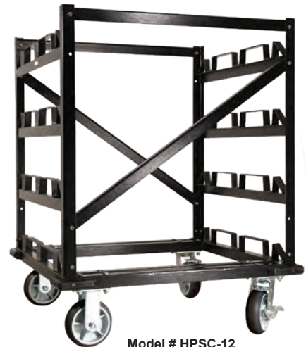
Model # HPSC-12