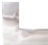
Polished Chrome PC