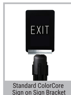
Standard ColorCore Sign on Sign Bracket