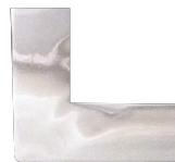
Polished Chrome PC