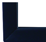
Smooth Black SB