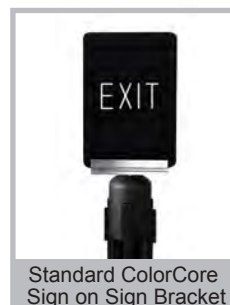
Standard ColorCore Sign on Sign Bracket