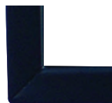
Smooth Black SB