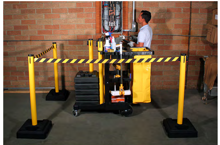
Kit shown: Cart with Additional 4 Posts

Manufacturing: Close aisles or block hazards while machinery is being repaired.