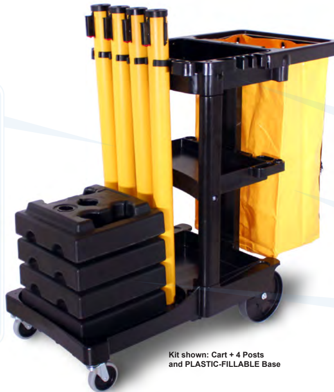
Kit shown: Cart + 4 Posts and PLASTIC-FILLABLE Base

Integrated tool holder and shelf: for a portable work station.