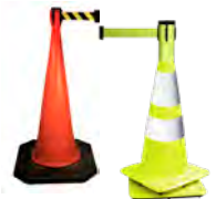
Cone Mounted: 10' and 15' RC10, RC15 Cones sold separately