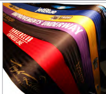
Belt & Rope Printing