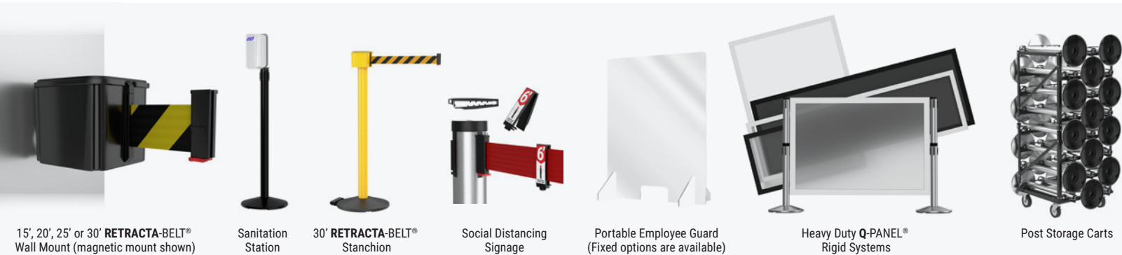
15', 20', 25' or 30' RETRACTA-BELT® Wall Mount (magnetic mount shown)