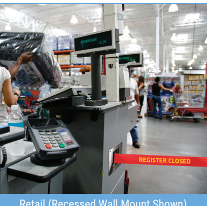
Retail (Recessed Wall Mount Shown)